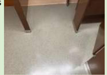
New Flooring and Partitions