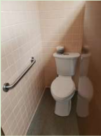
New Low Flow Toilets