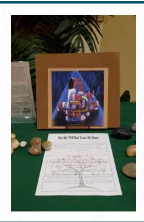
Good Friday Interactive Stations