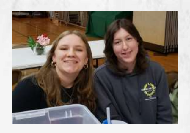
Youth Group Stuffing Eggs for Easter Egg Hunt