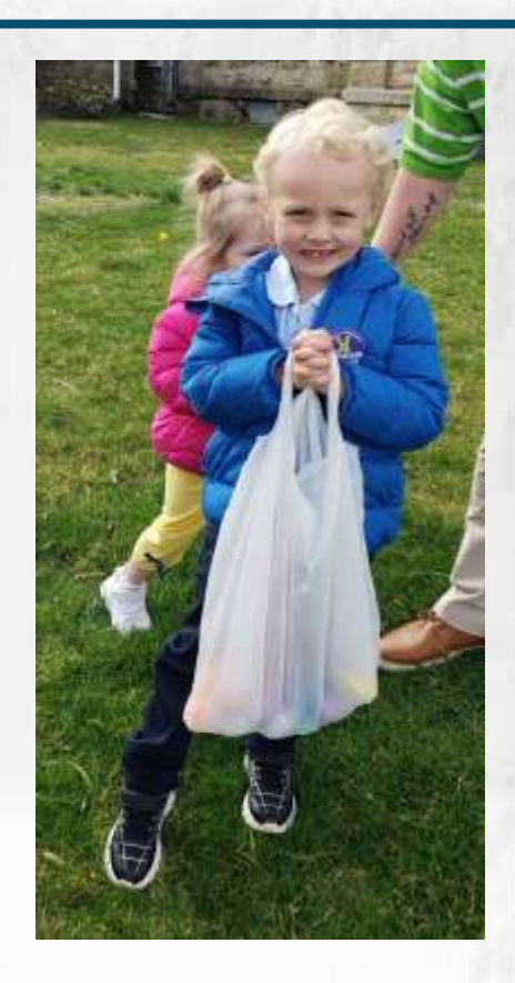
Easter Egg Hunt 2024